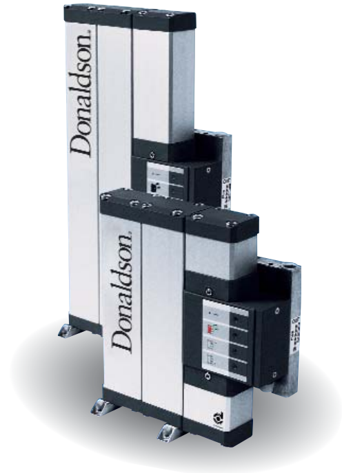
UP0015-60 and UP0020-60