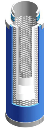
FF, MF, and SMF

By using various filtration mechanisms such as impaction, sieving, and diffusion, liquid aerosols and solid particles down to the size of 0.01 µm are being retained in the filter.